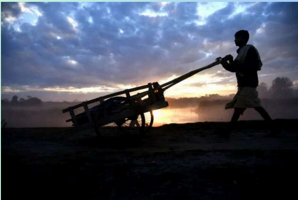
The sun can rise nearly two hours earlier in the east of India than in the far west

Mr Jagnani says that back of the envelope estimates suggested that India would accrue annual human capital gains of over $4.2bn (0.2% of GDP) if the country switched from the existing single time zone to the proposed two time zone policy: UTC+5 hours for western India and UTC+6 hours for eastern India. (UTC is essentially the same as Greenwich Mean Time or GMT but is measured by an atomic clock and is thus more accurate.)